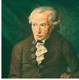
Immanuel Kant (1724 - 1804)

Kant's good will and the principle of universalization Along with Aristotle, Kant is without any doubt the classical giant of practical philosophy. Whatever notion of practical reason we may have today, we can hardly define and explain it without relating it to these two thinkers. As different as their philosophies are, they share a fundamental interest in the problem of practical reason , that is, the question of how reason can and should guide good practice in human affairs.