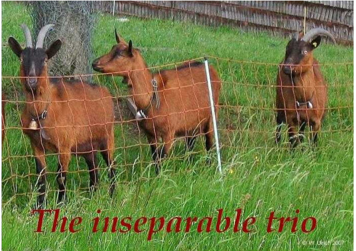
The inseparable trio (three cornerstones of critical pragmatism)

„We can situate critical pragmatism in the center of three research traditions: critical theory, pragmatic thought, and reflective practice. They constitute the inseparable trio of critical pragmatism. ”